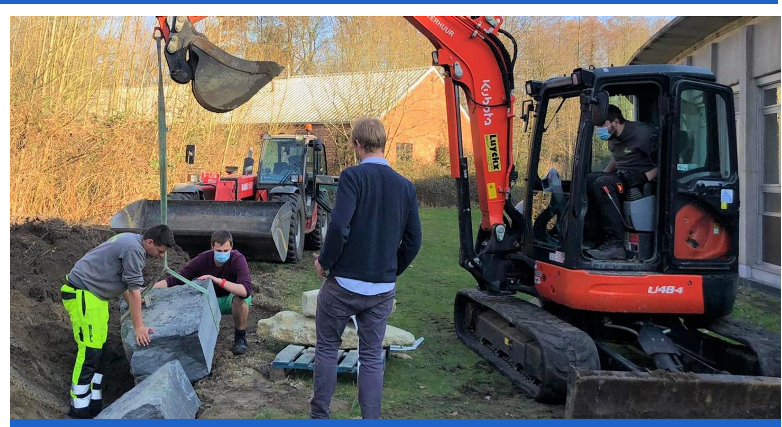
Landscaping the Rock Garden: a team effort to carefully position the blocks.